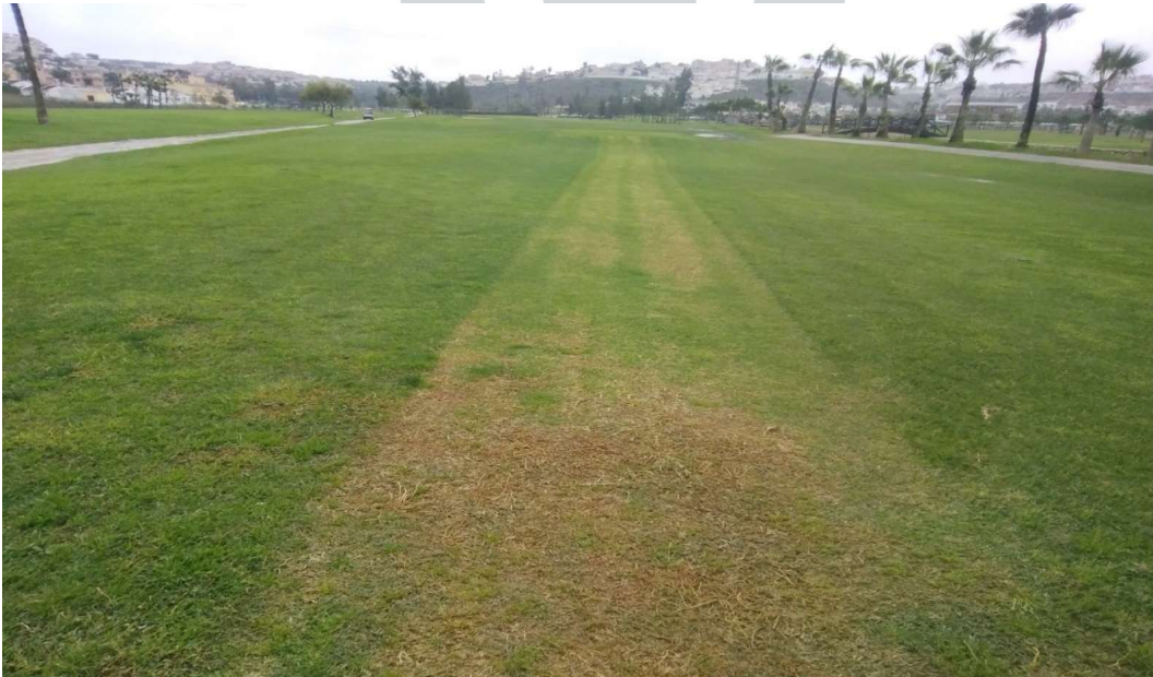
Corridors tee to fairways